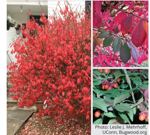
Burning Bush Euonymus alatus