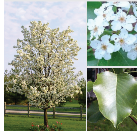
Bradford Pear Pyrus calleryana