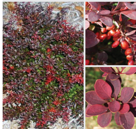
Japanese Barberry Berberis thunbergii