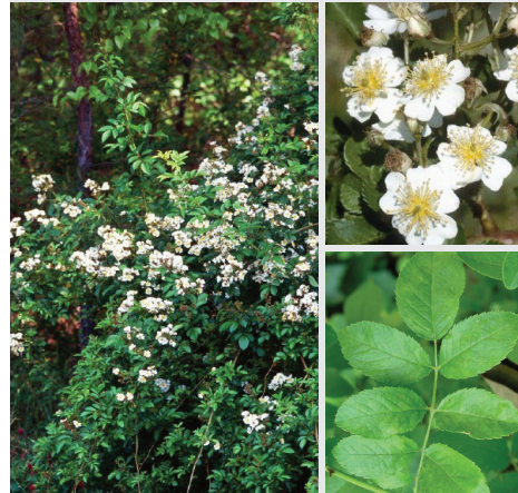
Multiflora Rose Rosa multiflora