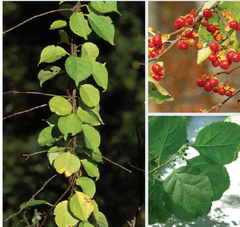
Oriental Bittersweet Celastrus orbiculatus