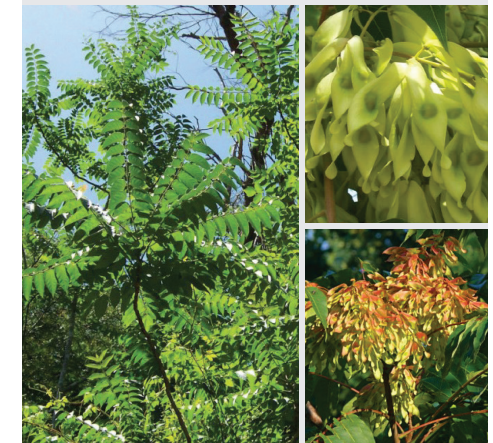
Tree of Heaven Ailanthus altissima