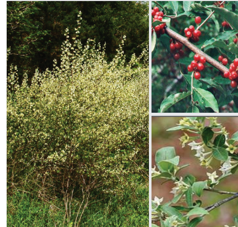
Autumn Olive Elaeagnus umbellata